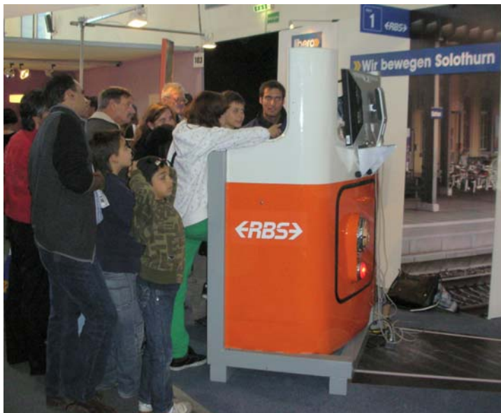
Use at the Autumn Fair in Solothurn HESO 08 Simulators are great crowd pullers