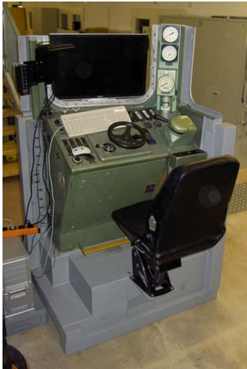
Driver's desk RBS